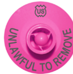
Tamper Proof Button